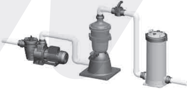
Installation with optional Mounting Stand

An optional Mounting Stand is also available for situations where the MultiCyclone cannot be installed directly above your pool pump.