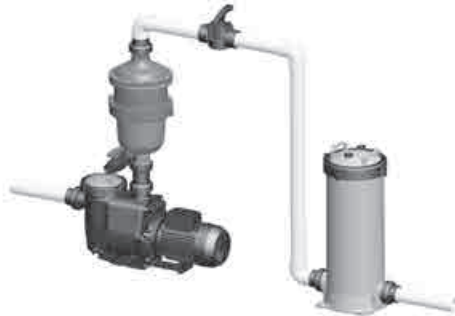
Installation with 2 way shut off valve

Whilst the pump is not operating close the 2 way shut off valve and open the purge valve. Switch on the pump to purge the sediment chamber of its sediment. Once the sediment chamber is purged, switch off the pump and open the 2 way shut off valve and close the purge valve.