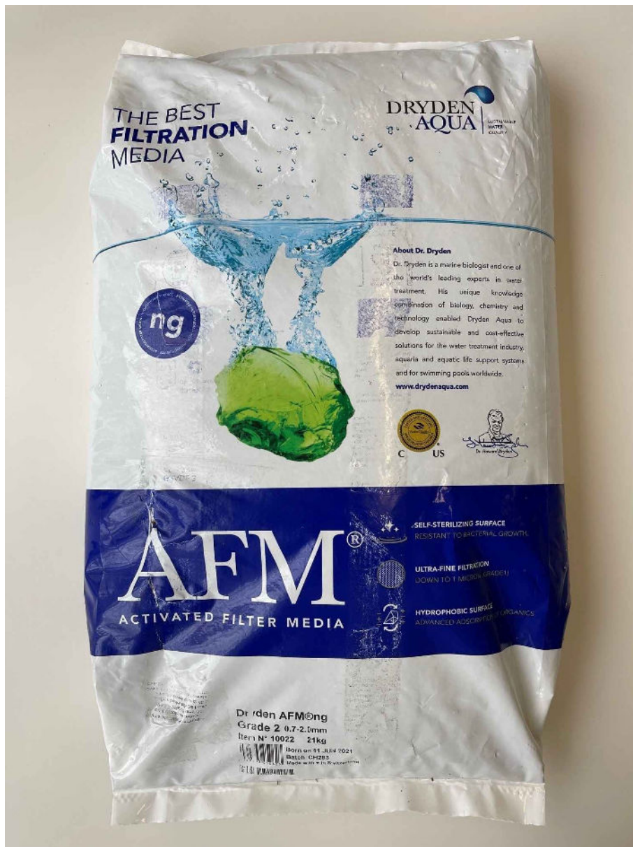
Picture 1 Original packaging Dryden AFM NG Grade 2, 0.7-0.2 mm

Dieser Auftrag wurde im GMP-zertifizierten Bereich durchgeführt.