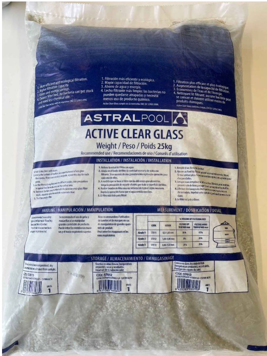
Picture 1 Original packaging ASTRAL POOL active clear Glass