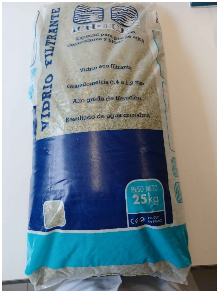
Picture 1 Original packaging ION PURE 0.4-1.2 mm