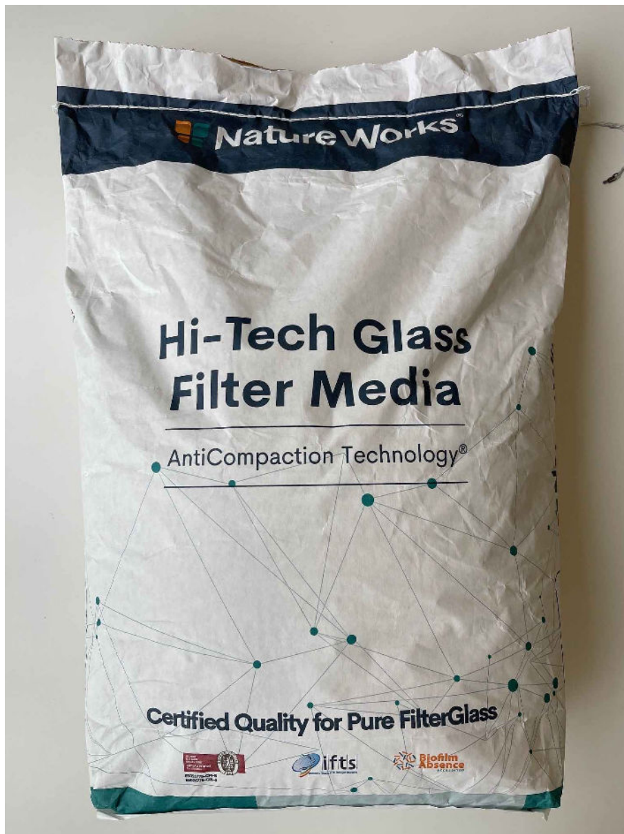
Picture 1 Original packaging Nature works Hi-Tech Glas Filter Media

This order was carried out within the scope of GMP certification.