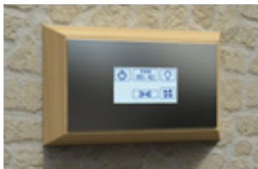
Stainless Steel Touch Control (for steam generators)