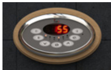
Classic Control (for steam generators)