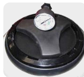
▪ Fast opening top lid